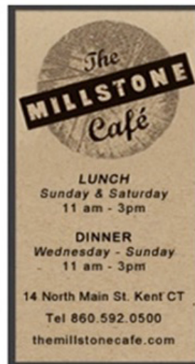
Large Ad (160x300 pixels)