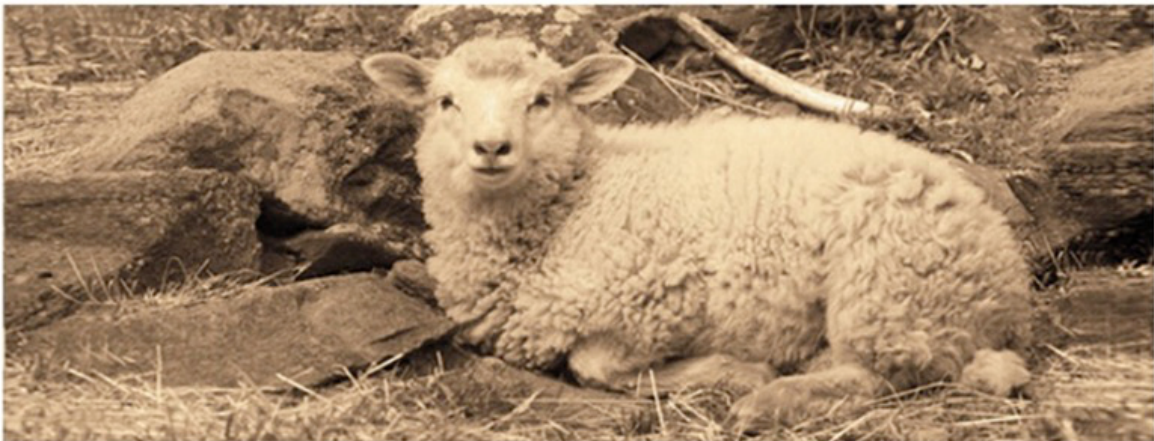
Banner Ad (1140x435 pixels)